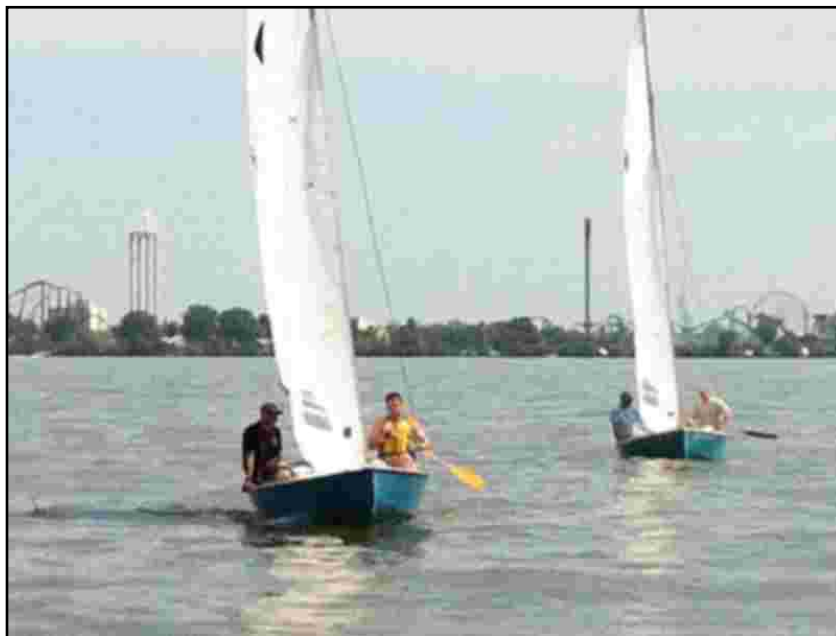
"The race of the paddles"